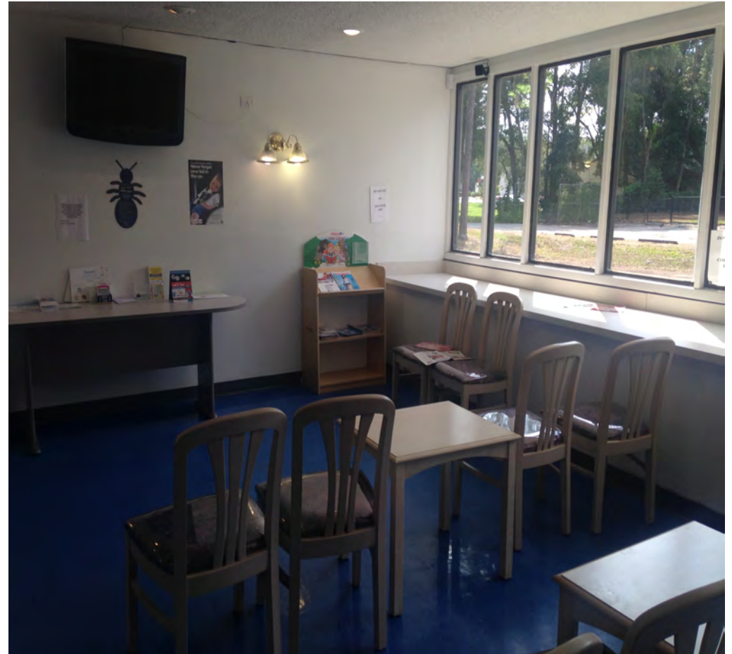
Large reception/waiting room.

8411 Baymeadows Way, Ste. 3 Jacksonville, FL 32256 Office (904) 354-1789 Fax (904) 354-2445