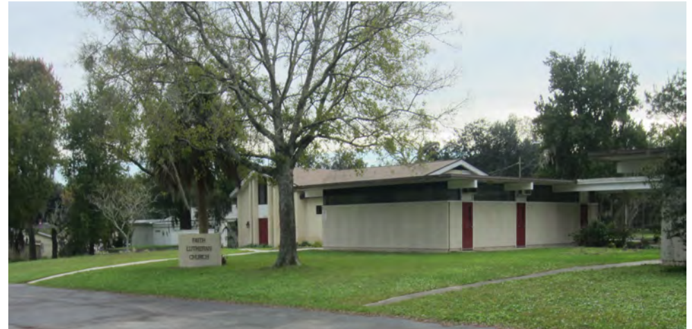
West view from Old Timuquana Road.

8411 Baymeadows Way, Ste. 3 Jacksonville, FL 32256 Office (904) 354-1789 Fax (904) 354-2445